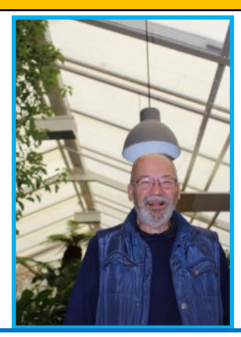
Spent too long in China?

A big thank you to all those members who have organised our Lunch Runs and visits through the year.