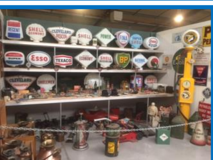
As it was