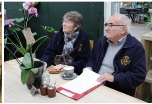
Too big for the pot