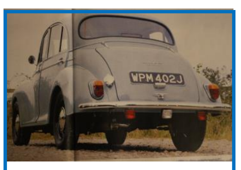
Exit left - the Minor