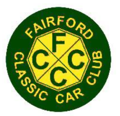
Member of the Federation of British Historic Vehicle Clubs