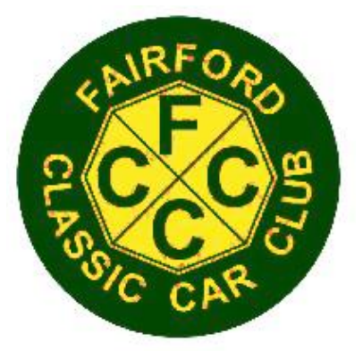
Member of the Federation of British Historic Vehicle Clubs